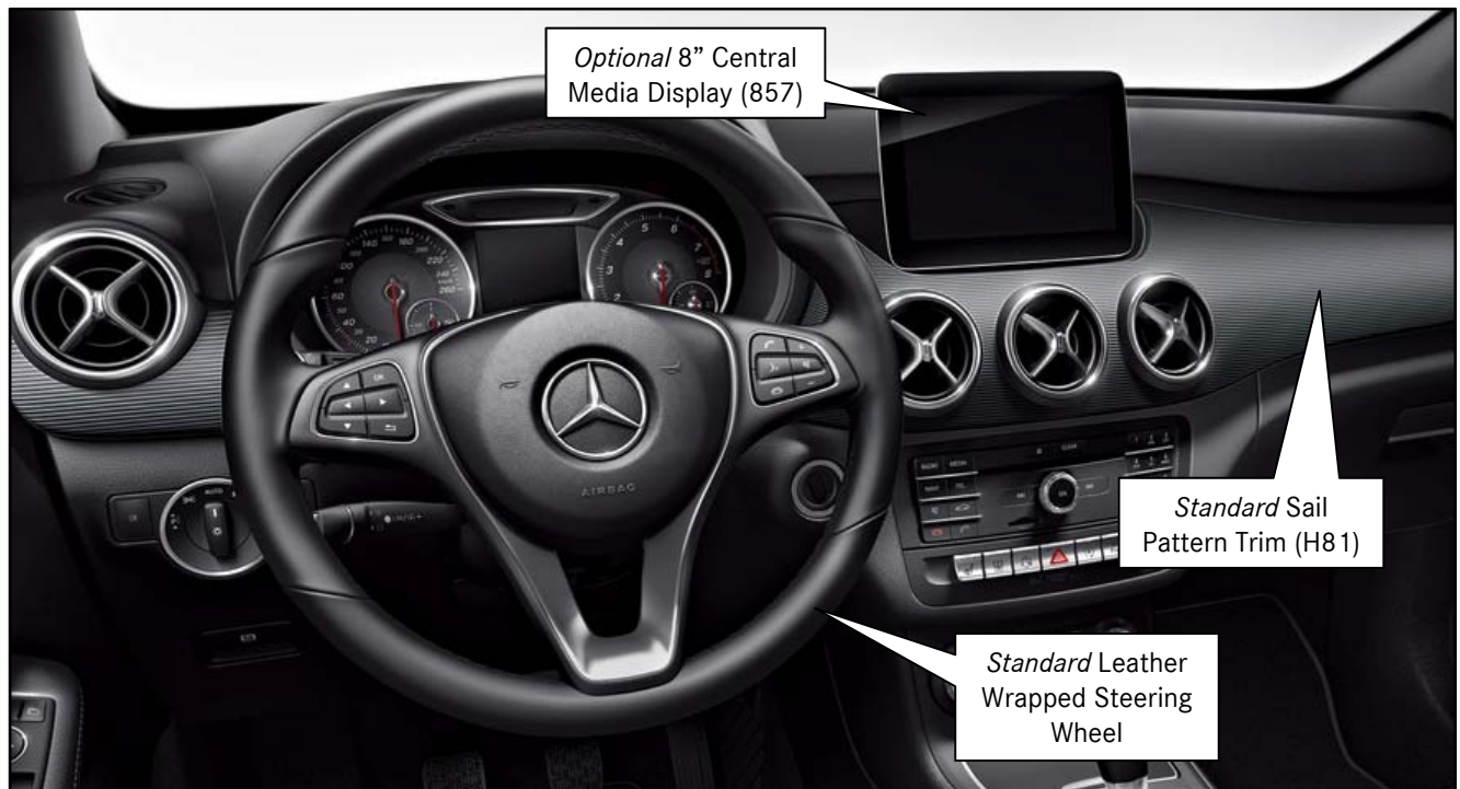
B 250 and B 250 4MATIC