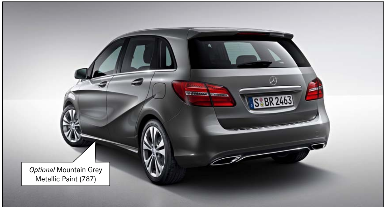
B 250 and B 250 4MATIC

Optional Mountain Grey Metallic Paint (787)