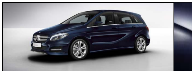
Cavansite Blue (890)