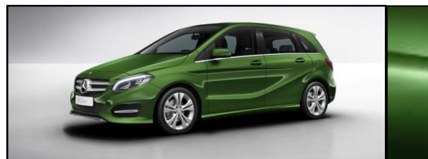
Kryptonite Green (175)