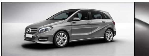
Mountain Grey (787)