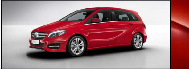
Jupiter Red (589)