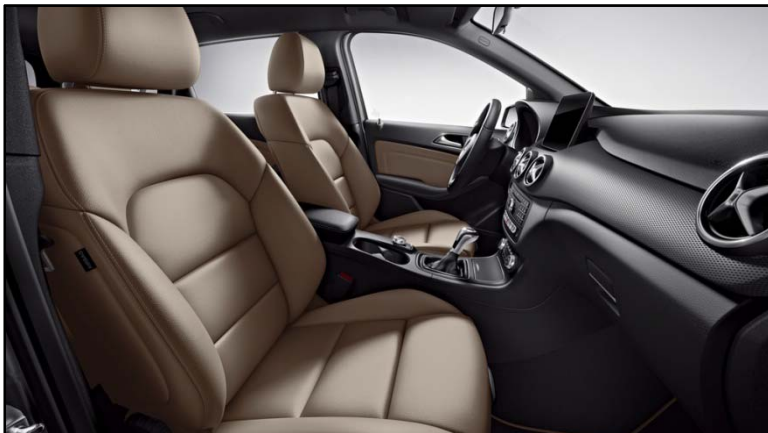
Crystal Grey (118)