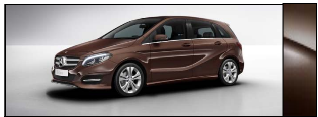
Cocoa Brown (990)