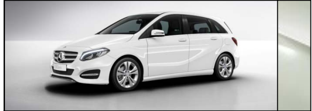
Calcite White (650)