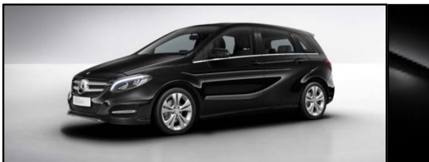
Nocturnal Black (696)