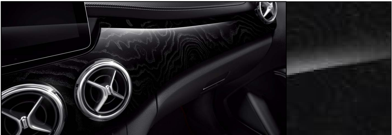
Dark Ash Wood (736) - $250