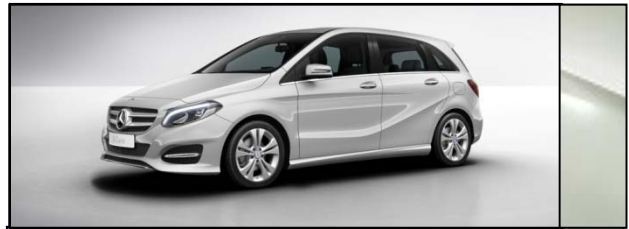
Polar Silver (761)