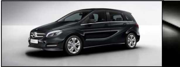
Cosmos Black (191)