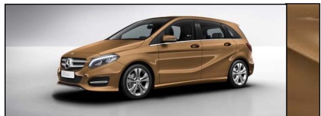
Canyon Beige (895)