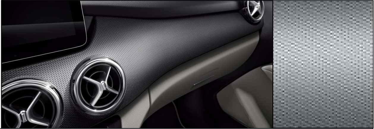
Sail Pattern (H81) – n/c