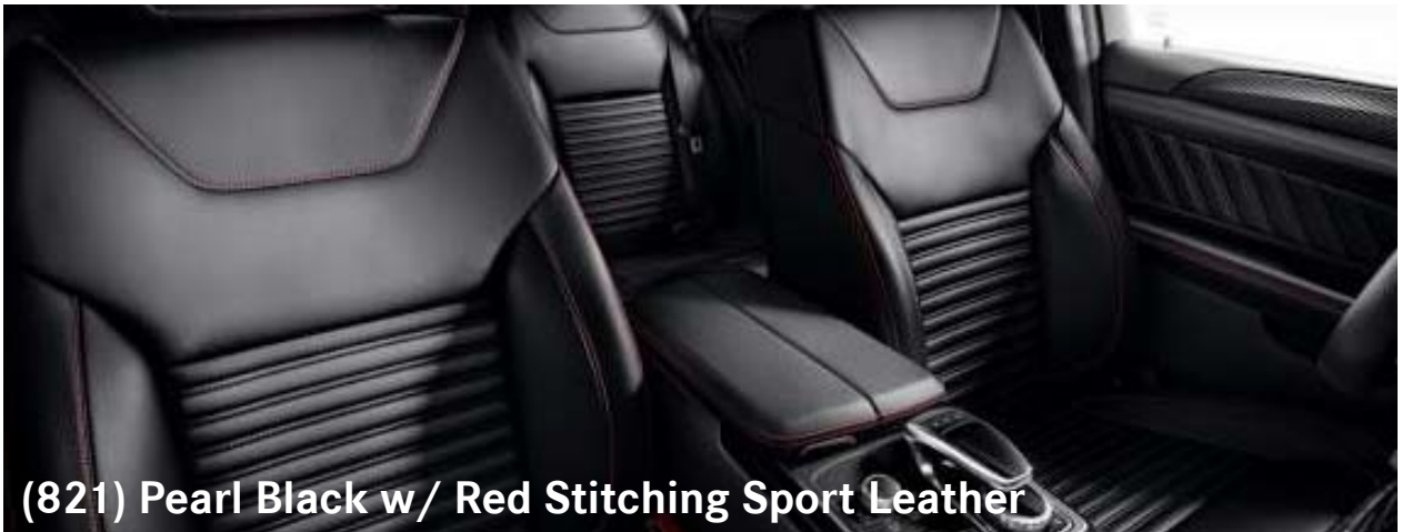
(821) Pearl Black w/ Red Stitching Sport Leather