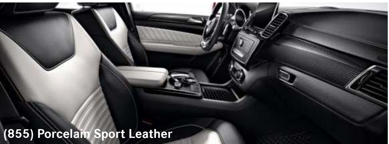
(855) Porcelain Sport Leather