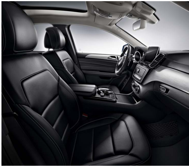
(211) Black Leather