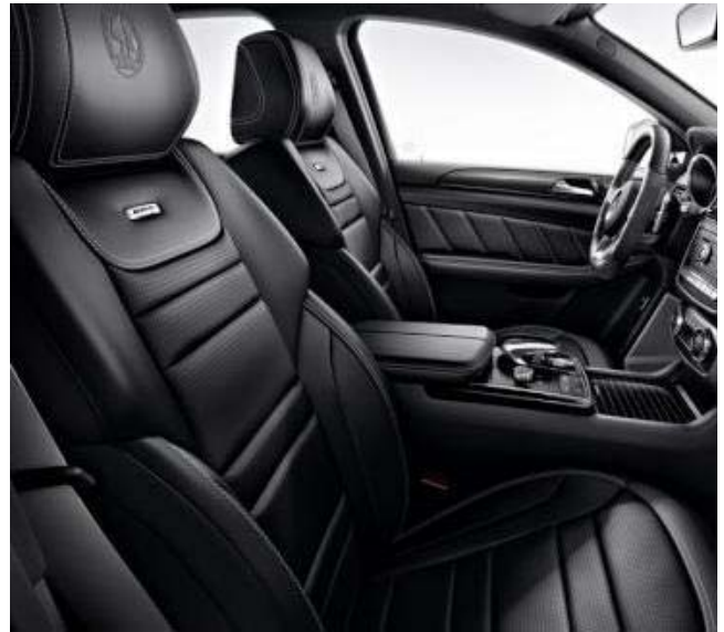
(541) Black w/ Contrast Stitching AMG Exclusive Nappa Leather