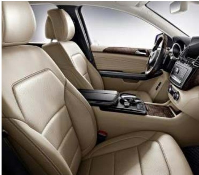
(225) Ginger Beige Leather