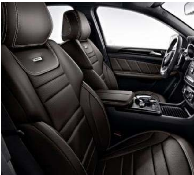
(534) Espresso Brown AMG Exclusive Nappa Leather