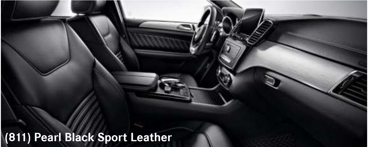
(811) Pearl Black Sport Leather