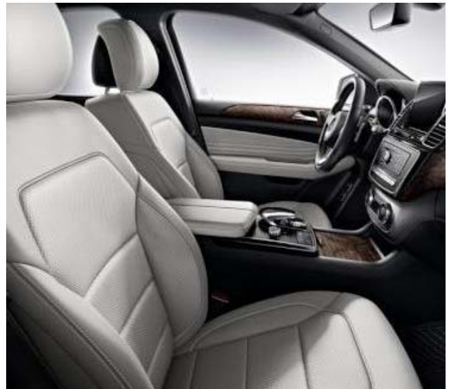
(228) Crystal Grey Leather