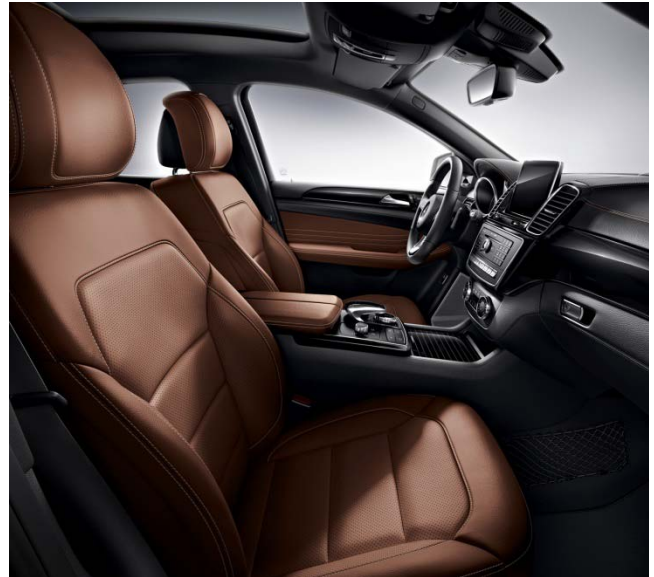
(224) Saddle Brown Leather