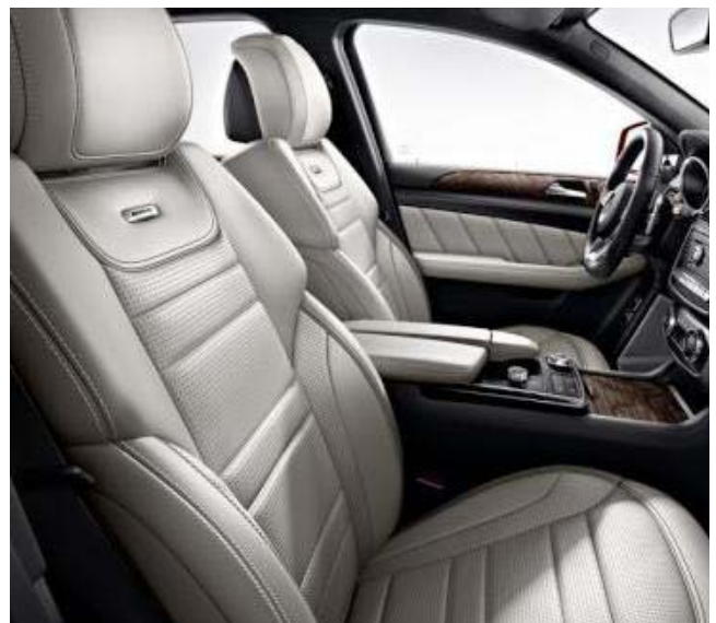
(535) Porcelain AMG Exclusive Nappa Leather